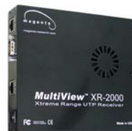
MultiView XR-2000DP-SAP Receiver 400R3585