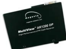
MultiView AK1200DP-SAP Receiver 400R3694