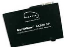
MultiView AK600DP-SAP Receiver 400R3769